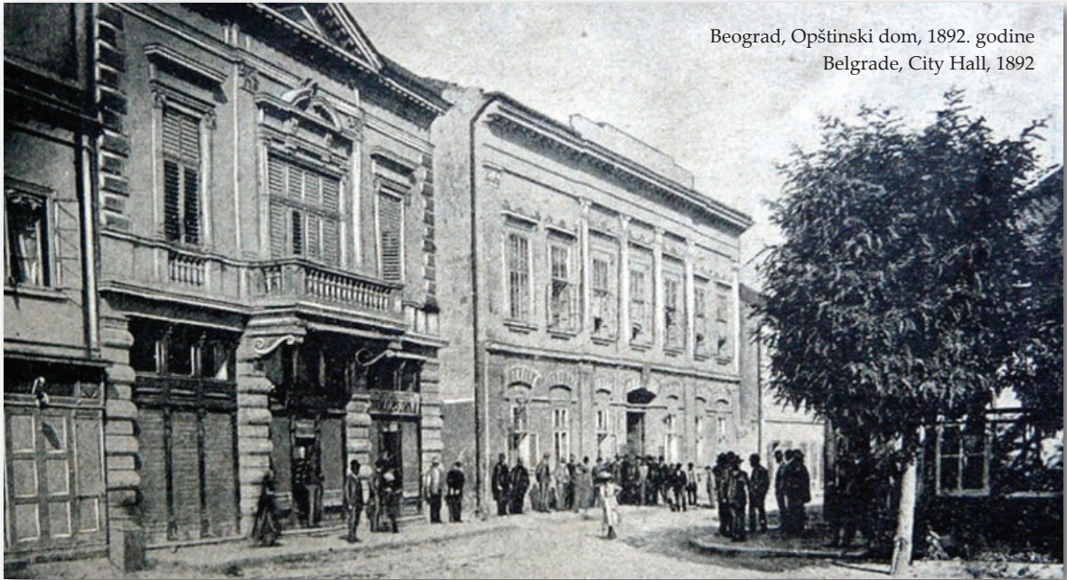
Beograd, Opštinski dom, 1892. godine Belgrade, City Hall, 1892

neither federalism nor centralism, but instead advocated a form of the English (regional) self-governance (provinces with separate parliaments). The idea of a decentralized state in which he tried, in as realistic manner as possible, to regulate the relations between Serbia and Croatia, was opposed by many people, including his party comrades, first and foremost Nikola Pasic. This was the formal reason for the definite split of these two leading figures of the Radical Party after 40 years of joint party activities. Historians, however, agree that the real cause of dispute of these two politicians was the appointment of Stojan Protic by Regent Alexander Karadjordjevic for the Prime Minister of the first Government of the Kingdom of Serbs, Croats and Slovenes.